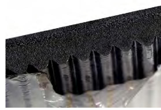
Underside of a grooved membrane.

The grooved profile increases the surface area of the bitumen and, as the film is only in contact with the peaks of the grooves, it can be dispersed 30% faster.